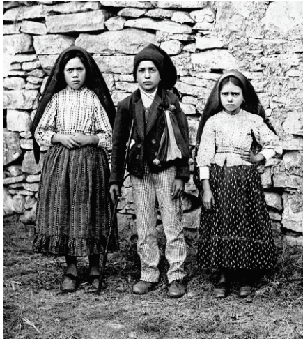
Lúcia dos Santos (left) with her cousins Francisco and Jacinta Marto, 1917

Our Lady appeared to the children between May and October, usually on the 13 th of the month (unless they were detained by authorities) and asked them "to pray a lot, a lot for the sinners and sacrifice a lot, as many souls perish in hell because nobody is praying or making sacrifices for them."